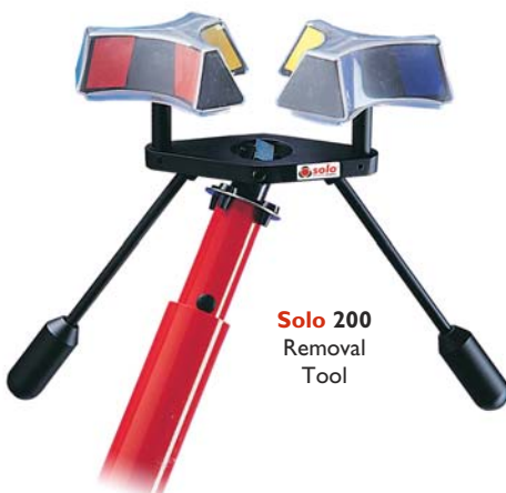
Solo 200 Removal Tool