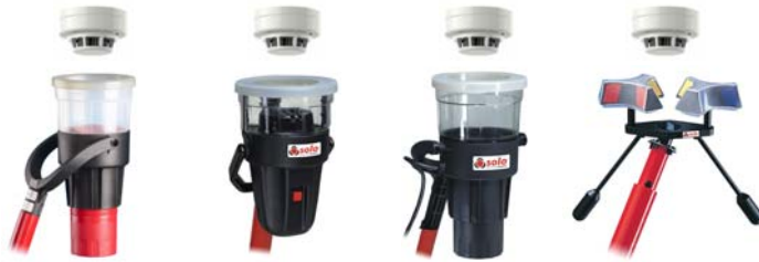
Solo 330 Aerosol Dispenser