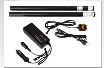
Solo 726 Fast Charger