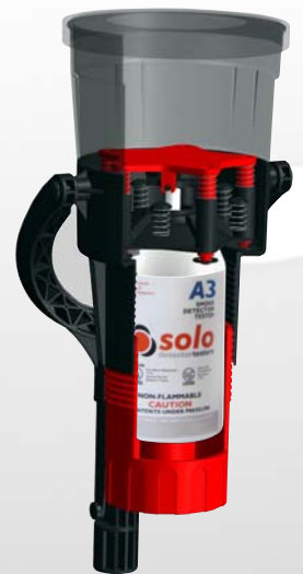
Solo 330 for use with Solo A3 & C3 Aerosols

Solo 332 is available for larger diameter detectors.